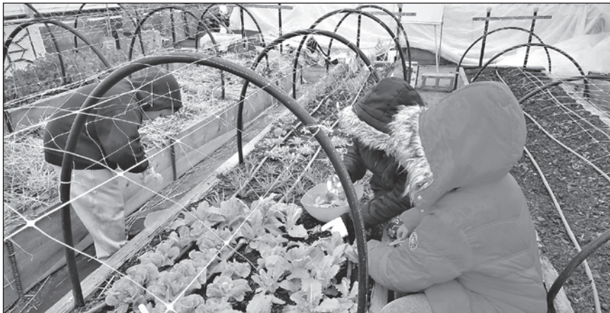
HIGHLAND YOUTH GARDEN

Directions: In Columbus, exit I-70 at Broad St./Rte. 40. Drive west on Broad St. Turn left on Clarendon St., right on Palmetto St., and then right on S. Highland Ave.