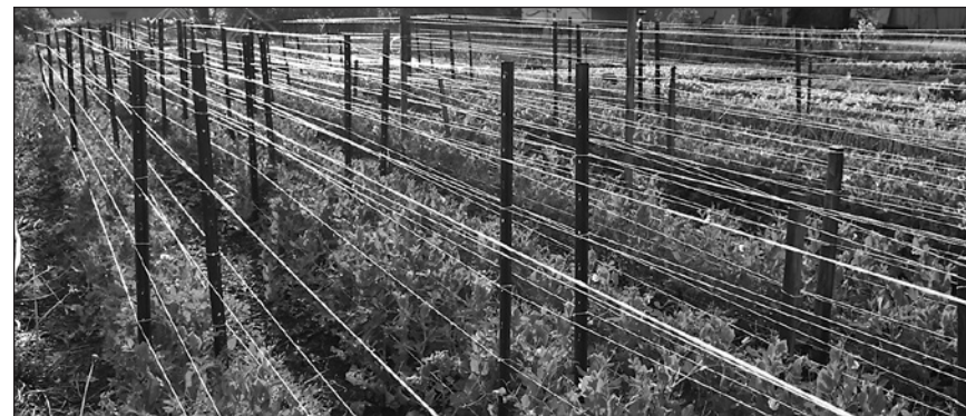
PEACE LOVE AND FREEDOM FARM