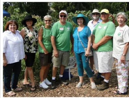
1 Based on OSU Extension, Franklin County's 2015 County Highlights