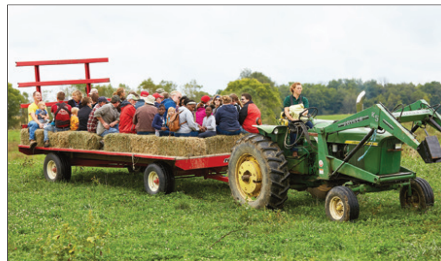
SWEET GRASS DAIRY

Directions: From Wooster, take Rte. 250 S to Apple Creek. In Apple Creek, turn left on Apple Creek Rd. and travel 1.8 miles. The farm is on the left.