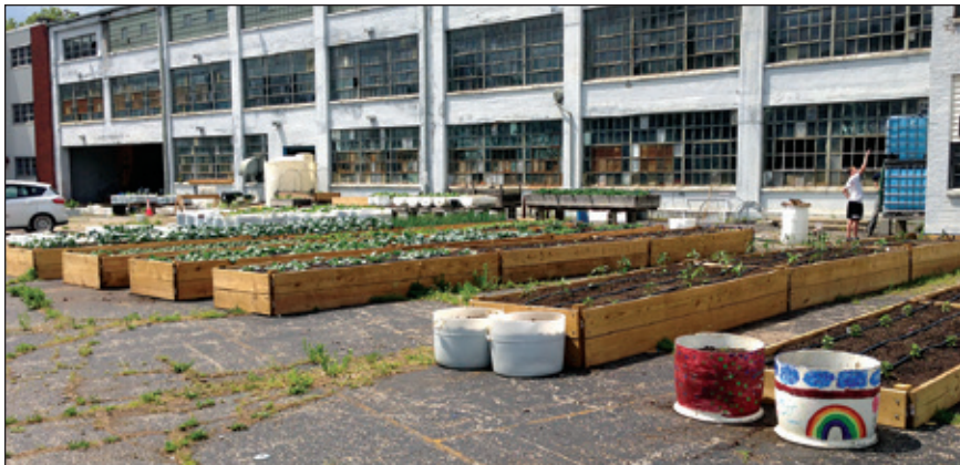
URBAN RENEWAL FARM