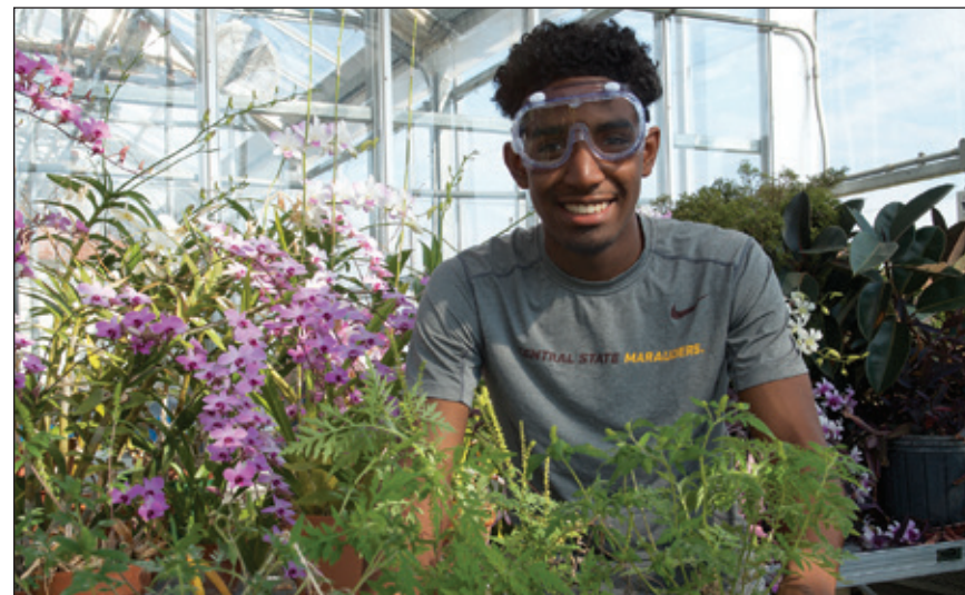
CENTRAL STATE UNIVERSITY AGRICULTURAL SCIENCES

Directions: From I-71, take Exit 111 for 17th Ave. Drive east 0.25 miles. Turn north on Cleveland Ave. and drive approximately 1.5 miles. Turn west on Arlington Ave. New Harvest is the first building on the left.