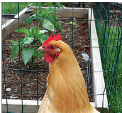
RACHEL TAYSE BAULLEUL