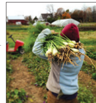
MILE CREEK FARM

Directions: From Dayton, follow Rte. 35 W from downtown Dayton towards Eaton. At W. 3rd St., turn left (west) to stay on Rte. 35 towards Eaton. Turn left on Diamond Mill Rd., and drive south for approximately 4 miles. Turn right on Mile Rd. and drive west. Mile Creek Farm is on the left in about 0.75 miles.