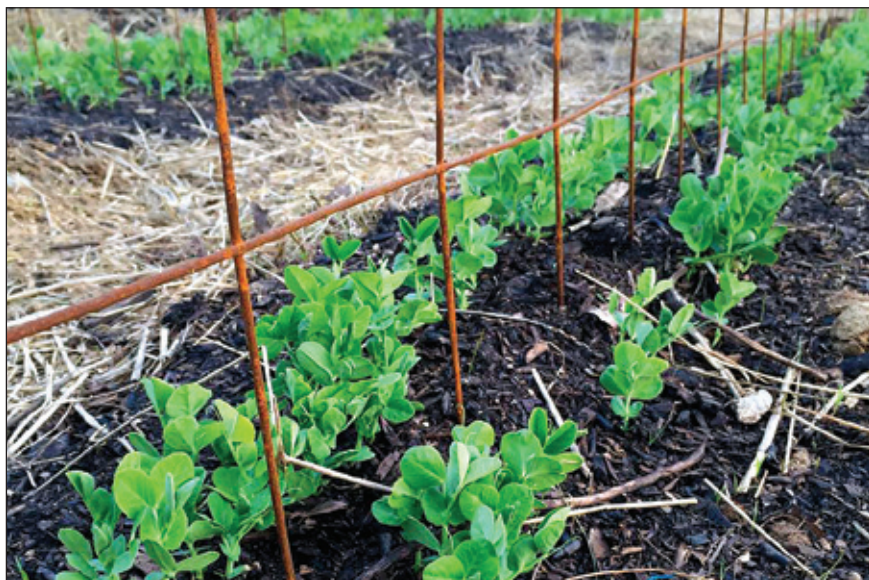
JEDIDIAH FARM AND STUDIO

Directions: From I-270 N, take Sunbury Rd. Turn east on Smothers Rd. The farm is on the left nearly 2 miles east of the bridge. Park on the east side of the driveway, leaving space to turn around by the house.