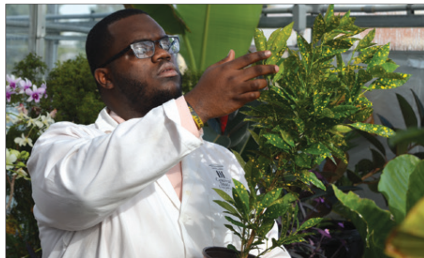
CENTRAL STATE UNIVERSITY AGRICULTURAL SCIENCES