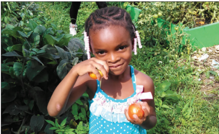
GLASS CITY CONNECTIONS

Lodging: While we strongly encourage all attendees to spend Friday night at the Procter Center to build professional networks and share farming knowledge, we understand that an overnight stay may not be possible for everyone. If you want to participate, but cannot spend the night, please contact OEFFA about special arrangements. To learn more about the Procter Center, go to www.proctercenter.org .